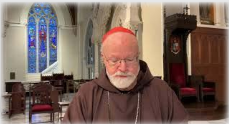
Greetings from Cardinal O'Malley OFM https://youtu.be/dmQFYcYOZk

While a full recording of the webinar can be watched, using this link: https://youtu.be/QTraUkwM3JY to the BCOS YouTube channel, the two videos below can be watched, using the links given below.